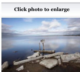
The shoreline of a salt pond in Alviso, Calif. is cluttered with construction...