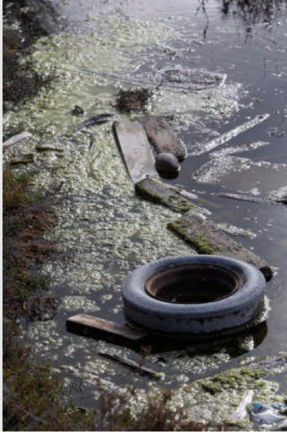
The shore of a salt pond in Alviso is filled with debris Jan. 12, 2010. The U.S. Fish and Wildlife Service and other agencies will break ground on a $3 million project to cut a 40-foot notch in the levees to allow salt water from the bay to flow back into the Guadalupe River to scour out years of accumulated silt, tule reeds and other unwanted vegetation. If successful, the project will regenerate the natural marshland and offer new flood protection for the city of Alviso which is below sea level.