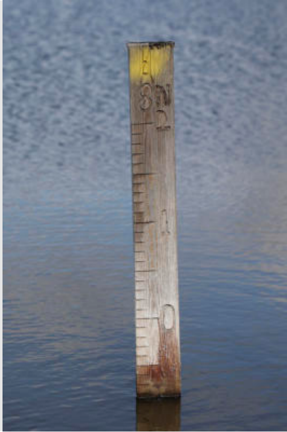
A water level indicator measures a salt pond in Alviso, Calif. on Jan. 12, 2010. The U.S. Fish and Wildlife Service and other agencies will break ground on a $3 million project to cut a 40-foot notch in the levees to allow salt water from the bay to flow back into the Guadalupe River to scour out years of accumulated silt, tule reeds and other unwanted vegetation. If successful, the project will regenerate the natural marshland and offer new flood protection for the city of Alviso which is below sea level.